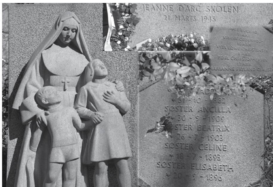
The monument to those who died, raised by the city of Copenhagen on the spot of the school

where I had been stuck and hemmed in, I came free. A second later a rain of fire sparks and burning beams crashed down where I had been lying ... (p.29-33) Another small miracle happened: a cross from one of the classrooms was found undamaged in the ruins, was saved and brought to the motherhouse. All the sisters that were killed during this attack are buried at the cemetery, where a memorial has been prepared for them. And in 1953 a monument was raised by the city of Copenhagen on the spot where the school was.