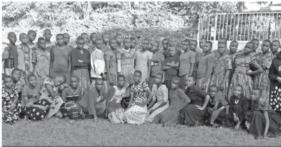
Girls from the hostel gathered outside

Saint Monica's Parish in Dublin supports many girls for their pre-college studies and tuition. The Croatian orphanage and the Anglican Organization also support a few girls in our Centre, and one family from the USA is sponsoring students for their education and for their stay at the Centre. We also have some "full-paying