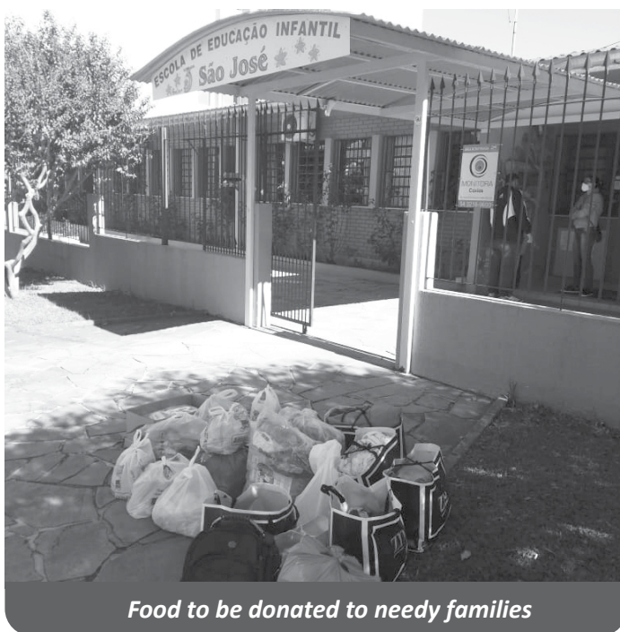
Food to be donated to needy families

with more joy using the Study Kit prepared with the help of teachers and school staff. We recognize that, as a school, we are privileged to be able to work to help our school children and families and we feel the affection, care, help and support from the St. Joseph Charitable-Literary Association. Courage is a gift which is supporting us on this journey, because God is with us and sustains us. And as Pope Francis tells us: "Imagination is half the disease; Tranquillity is half the remedy; And patience is the beginning of healing!"