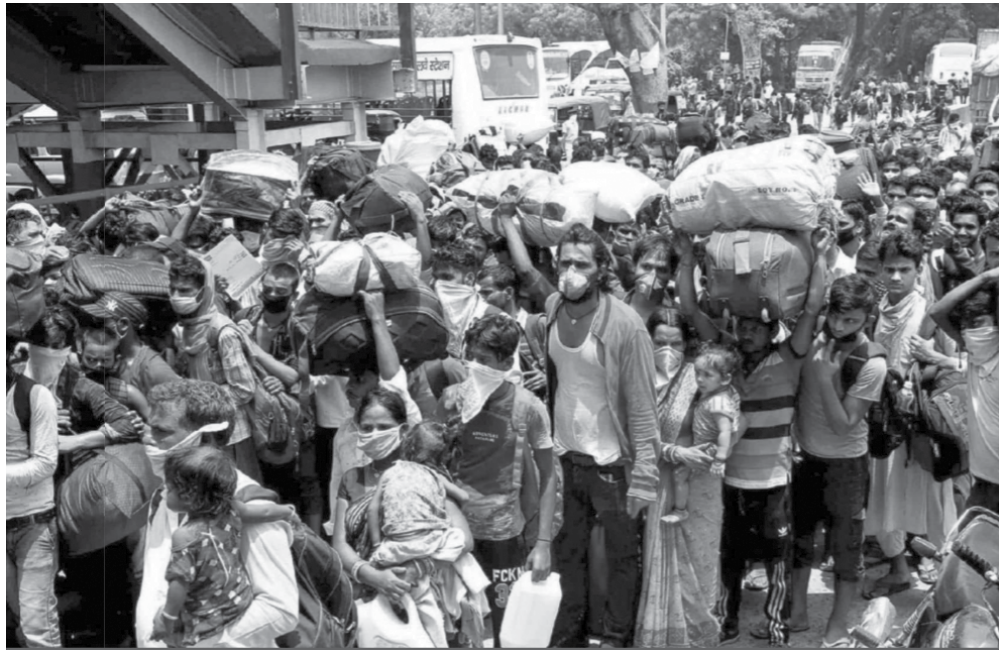
Migrant labourers returning to the state of Bihar

The central as well as state governments failed to provide food, transport, and shelter to India’s migrant Labourers. They had got only four hours’ notice before the country went into lockdown on the 25 th of March. Many Covid-19 affected people in India now are migrant