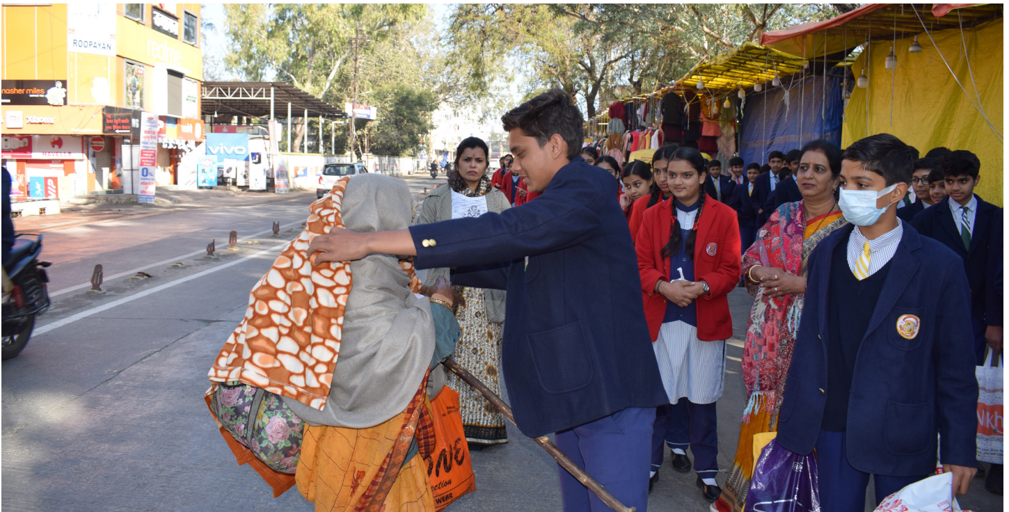
A student offering shawl to an elderly lady

During the second, third and fourth weeks of January, around 1100 students and 30 teachers enthusiastically participated in the drive. The primary