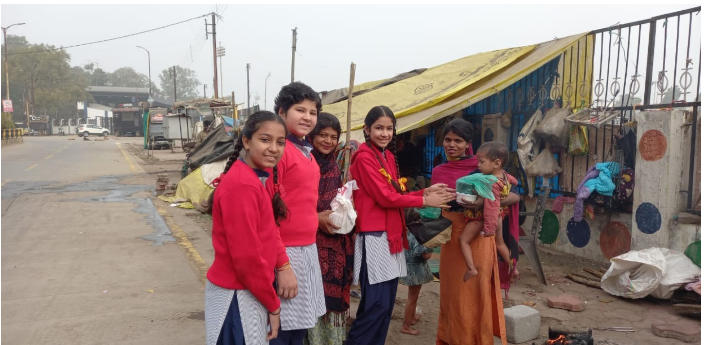
Students handing over food packets to pavement dwellers

Though small in scale, the drive brought the community closer together, reinforcing the values of compassion and solidarity. It carried a powerful message about the importance of caring for others and fostered a sense of collective responsibility. This drive represents a step forward in building a generation that understands the importance of sharing and caring. It was a wonderful opportunity for students to step out of their classrooms and make a positive impact on the lives of those less fortunate in their community.