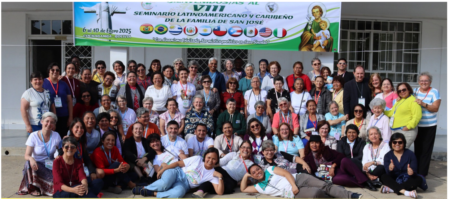
Those who attended the Seminar in January in Bolivia

disasters and proposing personal, community and social initiatives to mitigate the consequences of climate change, promote the resoration of conditions to preserve water sources and strengthen awareness and an attitude of caring for our common home.