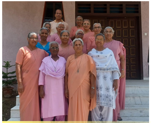
Transforming Grace Group