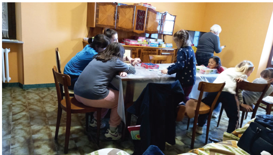
Ukrainian children with the Sisters of the Pinerolo community

of the Covid-19 pandemic and another great challenge appears on our doorstep. None of us had thought we would see so close at hand the great scourge of war and the flight of refugees in Europe. These events seemed like past history, but unfortunately this is not the case. "We all feel the seriousness of this time and how life is being threatened where it is most fragile. Once