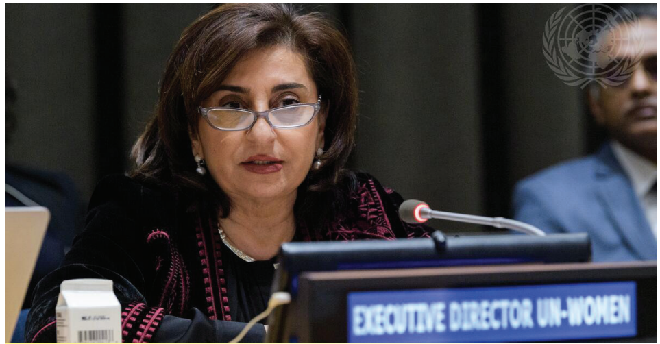
Executive Director of UN- Women

The plight of Ukraine women, refugees from the violence of war in their country also face gender-based violence. Women have taken their children and left their home, their city, their country, arriving in a place totally unfamiliar to them. When someone approaches them to offer shelter, they may accept what appears to be an offer of simple hospitality, yet in doing so can find themselves trapped and facing physical or sexual violence. An offer of shelter in exchange for the woman doing housekeeping or caring for children may be a way to enslave her, taking her freedom and subjecting her to physical and/or psychological violence. These vulnerable refugees can too easily fall