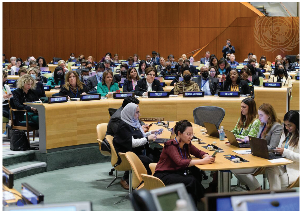
The group gathered for the event “Ending violence against women in politics”

In the context of the UN Commission on the Status of Women, March 14-25, 2022, held in hybrid format this year, both at the United Nations in New York and on line, the President of the General Assembly hosted a special event: Ending violence against women in politics. He stated that such violence is deeply rooted in culture, in bias and stereotypes concerning women’s place in society as subordinate to men. The director of UN Women said that 85% of women in politics have experienced violence, from hate speech to threats against their life. Such violence has